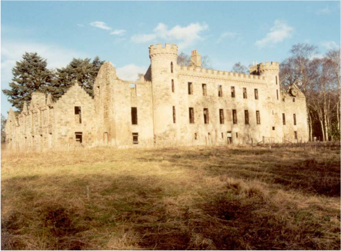
The Ruins from the South West in 2000