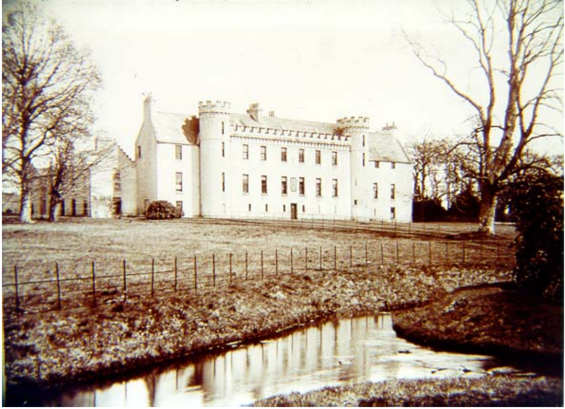
The Mansion House before the fire of 1919.